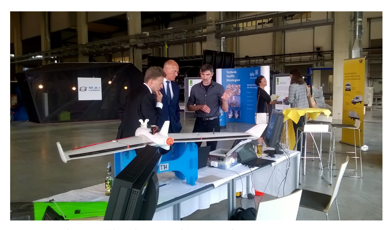
Figure 2: Augsburg's major Griebl (middle) at the stand of the University of Augsburg